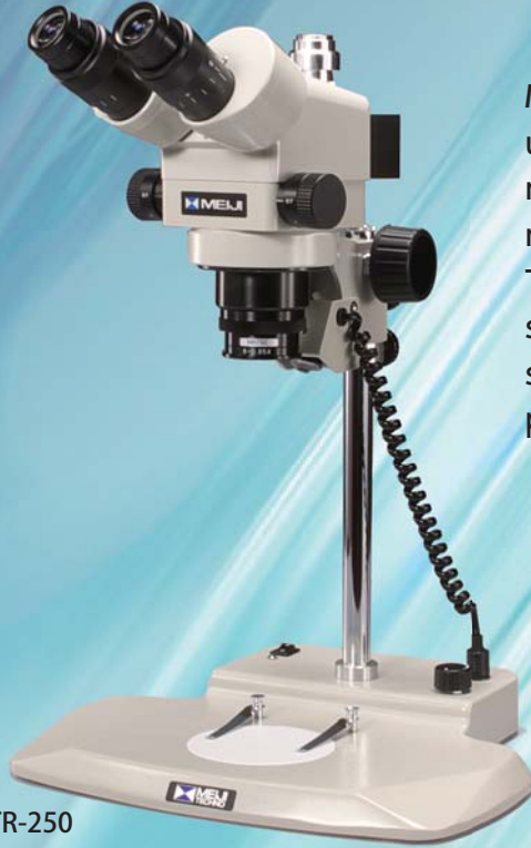
EMZ-TR-250 Made in Japan

Meiji Techno offers an economically priced training system using a high quality zoom stereo microscope for practicing microsurgical procedures in place of a costly surgical microscope.