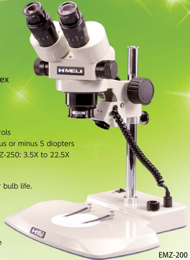
EMZ-200 Made in Japan