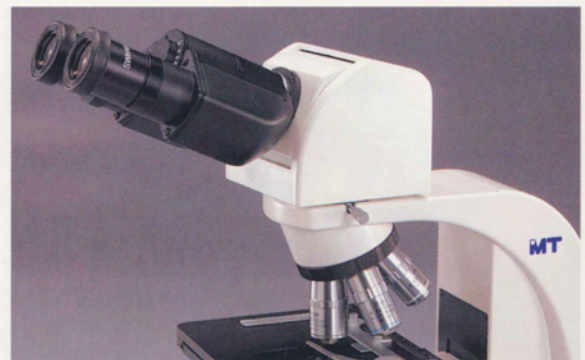
MA957 ERGONOMIC TILTING BINOCULAR HEAD (SIEDENTOPF TYPE)