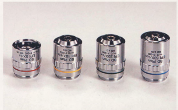
PLAN EPI OBJECTIVES