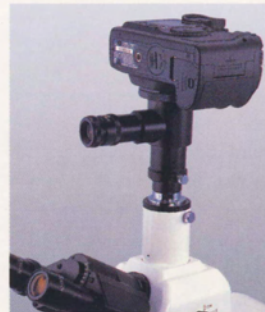
MA150/60 Camera attachment

These attachments are used to mount the camera with T2 adapter ring to the photo tube.