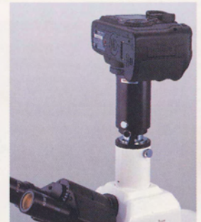
MA150/50 Camera attachment