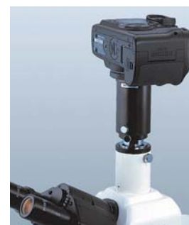
MA150/50 Camera attachment