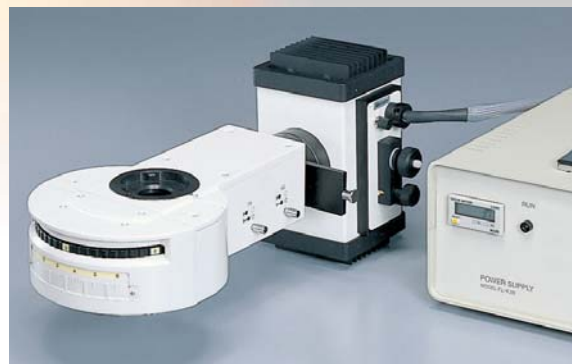
MT-EPI-2 EPI FLUORESCENT ATTACHMENT SET