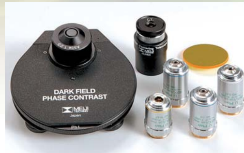
ZERNIKE PHASE CONTRAST SET