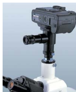
MA150/60 Camera attachment

These attachments are used to mount the camera with T2 adapter ring to the photo tube.