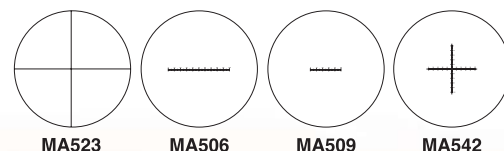
MA523 MA506 MA509 MA542