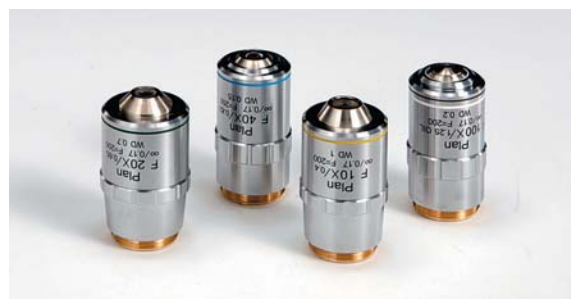
OBJECTIVES FOR FLUORESCENT MICROSCOPY