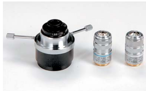
DARKFIELD CONDENSER AND OBJECTIVES WITH IRIS DIAPHRAGM