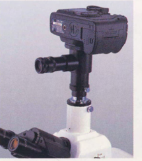
MA150/60 Camera attachment

These attachments are used to mount the camera with T2 adapter ring to the