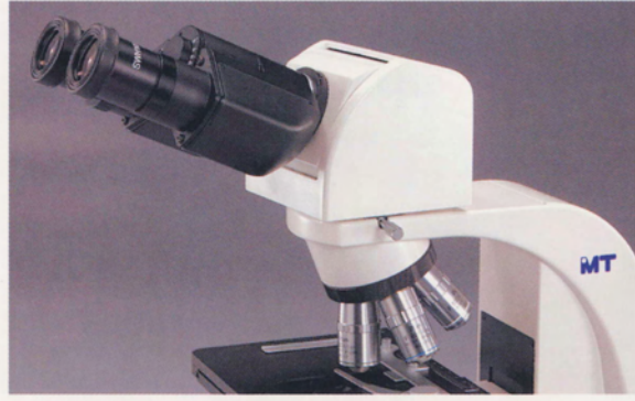
MA957 ERGONOMIC TILTING BINOCULAR HEAD (SIEDENTOPF TYPE)