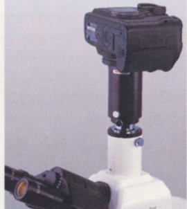
MA150/50 Camera attachment